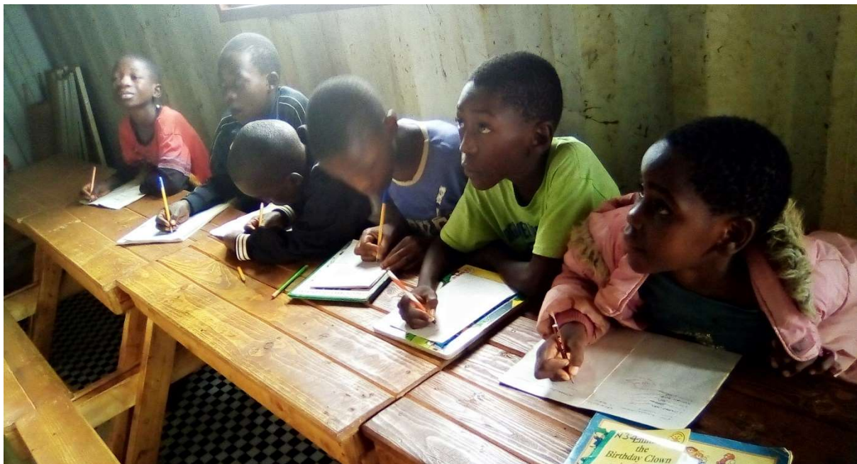
TEACHING VERBS. After assessing some readers I decided to teach them the verbs and they even wrote them in the books and the response was good.