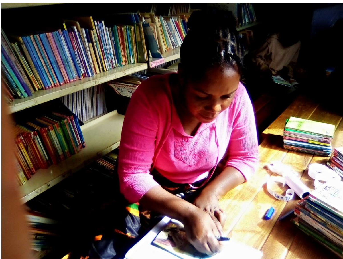
TAGGING OF BOOKS. The tagging of books commenced .